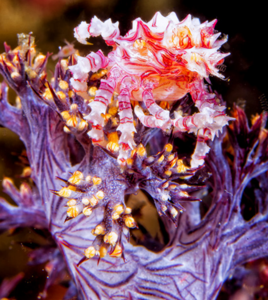
'Candy' decorator crab on host soft coral.